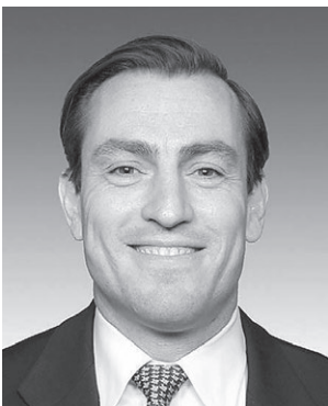
Vito Fossella '87

On February 29, the brothers of SigEp Penn Delta were fortunate enough to have alumnus Vito Fossella '87 visit as part of the house's Speaker Series. Fossella, who served in the U.S. House of Representatives for 12 years, was able to share his political experience as well as his memories from his time at Penn. Brothers loved hearing about how the idea of having a new bar in the basement came into fruition, as well as the lively political debate that everyone engaged