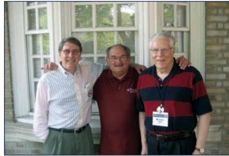
There are plenty of opportunities to reconnect with Penn Delta as an alum, including our alumni weekend each spring.

Penn Delta's funding base comprises our alumni, some of our parents and friends. It's that direct.