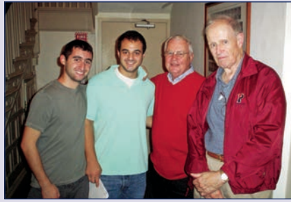
Hope to see you at Homecoming! This photo is from 2007's event.

Following the game, please join us for a post-game celebration at the chapter house. We'll have more refreshments and a light