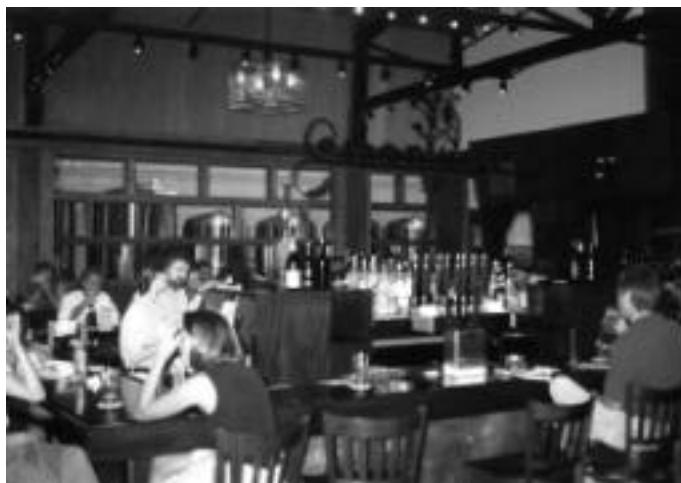
Bar at the Iron Hill Brewery in Media, PA.

With the encouragement and financial support of family, friends and Penn Delta brothers, Iron Hill Brewery and Restaurant was opened in November 1996 in Newark, Del. The brew pub quickly won the praise of critics for its creative menu, casual atmosphere and reasonable prices. Less than two years later a second brew pub was opened in one of the premier restaurant sites in the commercial heart of West Chester, Pa., and most recently a third location was