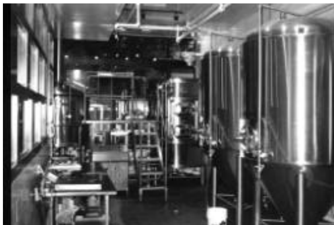
State-of-the-art equipment helps ensure beer of the highest quality.

Next time you find yourself in Newark, Del., West Chester, Pa., or Media, Pa., give Iron Hill Brewery & Restaurant a try — you will be glad you did.